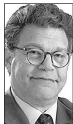
— Al Franken

"This is not about Norm Coleman's wife," Franken said. "This is about Senator Coleman's sugar daddy."