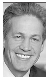
— Norm Coleman

"You have an ad that's defaming my wife. I think there's a line in this business. You can take any shot you want at the candidate. Mr. Franken, rather than rejecting it, is promoting it."